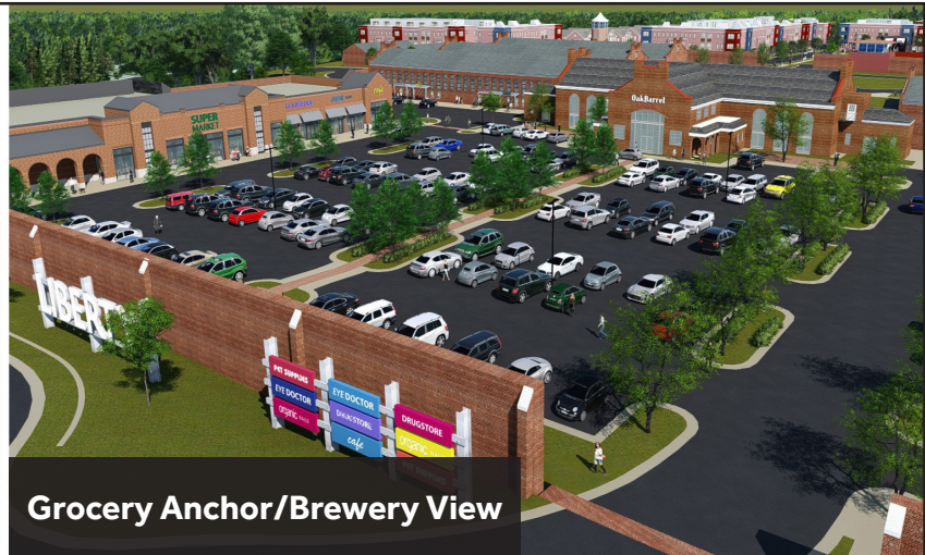
Grocery Anchor/Brewery View