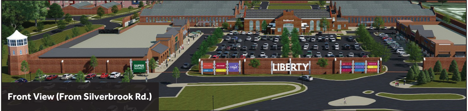
Front View (From Silverbrook Rd.)