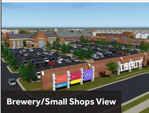
Brewery/Small Shops View