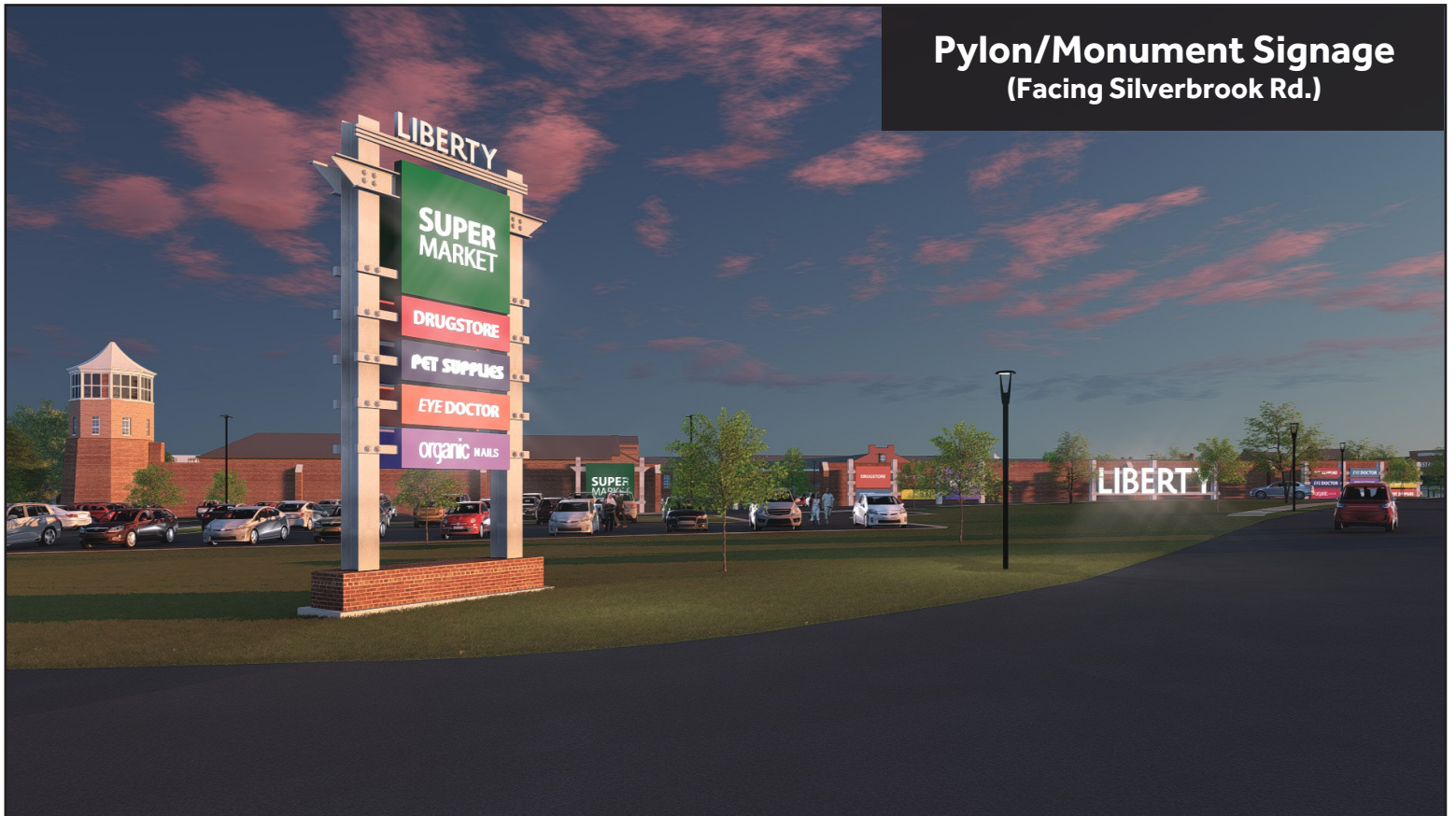
Pylon/Monument Signage (Facing Silverbrook Rd.)