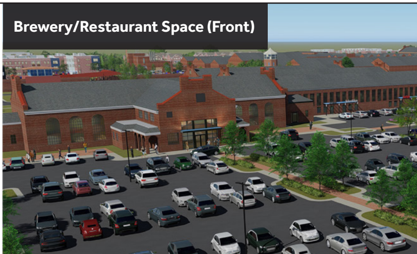
Brewery/Restaurant Space (Front)