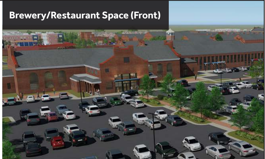
Brewery/Restaurant Space (Front)