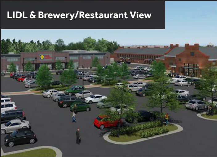
LIDL & Brewery/Restaurant View