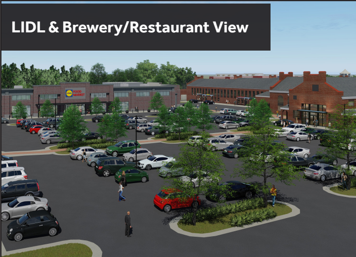
LIDL & Brewery/Restaurant View