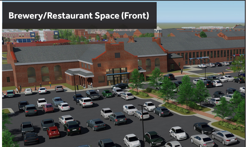
Brewery/Restaurant Space (Front)